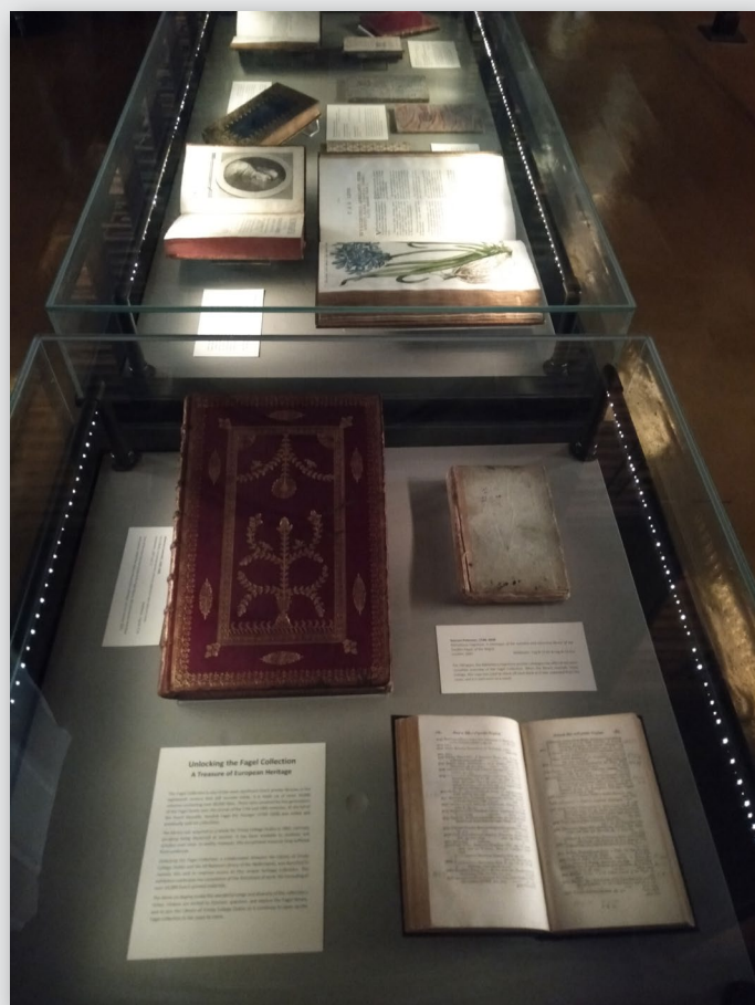
View of cases exhibiting items from the Fagel Collection

Launched in conjunction with the final celebratory symposium, a special exhibition of 21 unique objects from the Fagel library was curated for display in TCD's iconic Long Room. This exhibition drew attention to the diversity of holdings in the Fagel Collection, their unique and exquisite quality, and related this to their significance for European heritage. Installed from June to September 2023, the display was seen by over 375,000 visitors to the Old Library. The exhibition moreover drew significant media attention in Ireland with a feature piece in the Irish Times , and a web article in the widely popular Fine Books & Collections magazine.