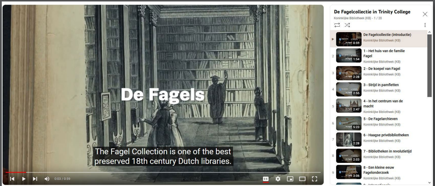
The Fagel video playlist on the KB YouTube channel