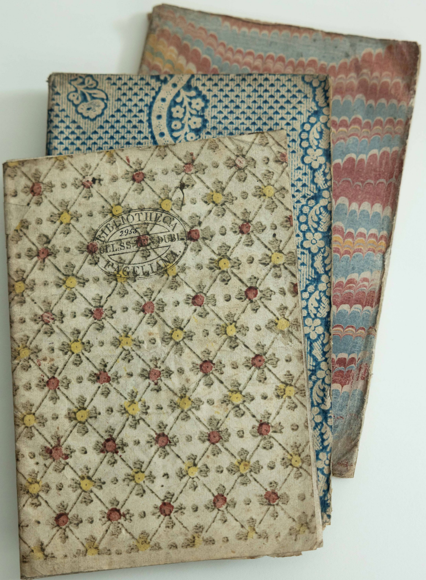
Three works of poetry and song in decorative paper wrappers from the late Eighteenth-century (Fag.N.16.32 no.4-6)