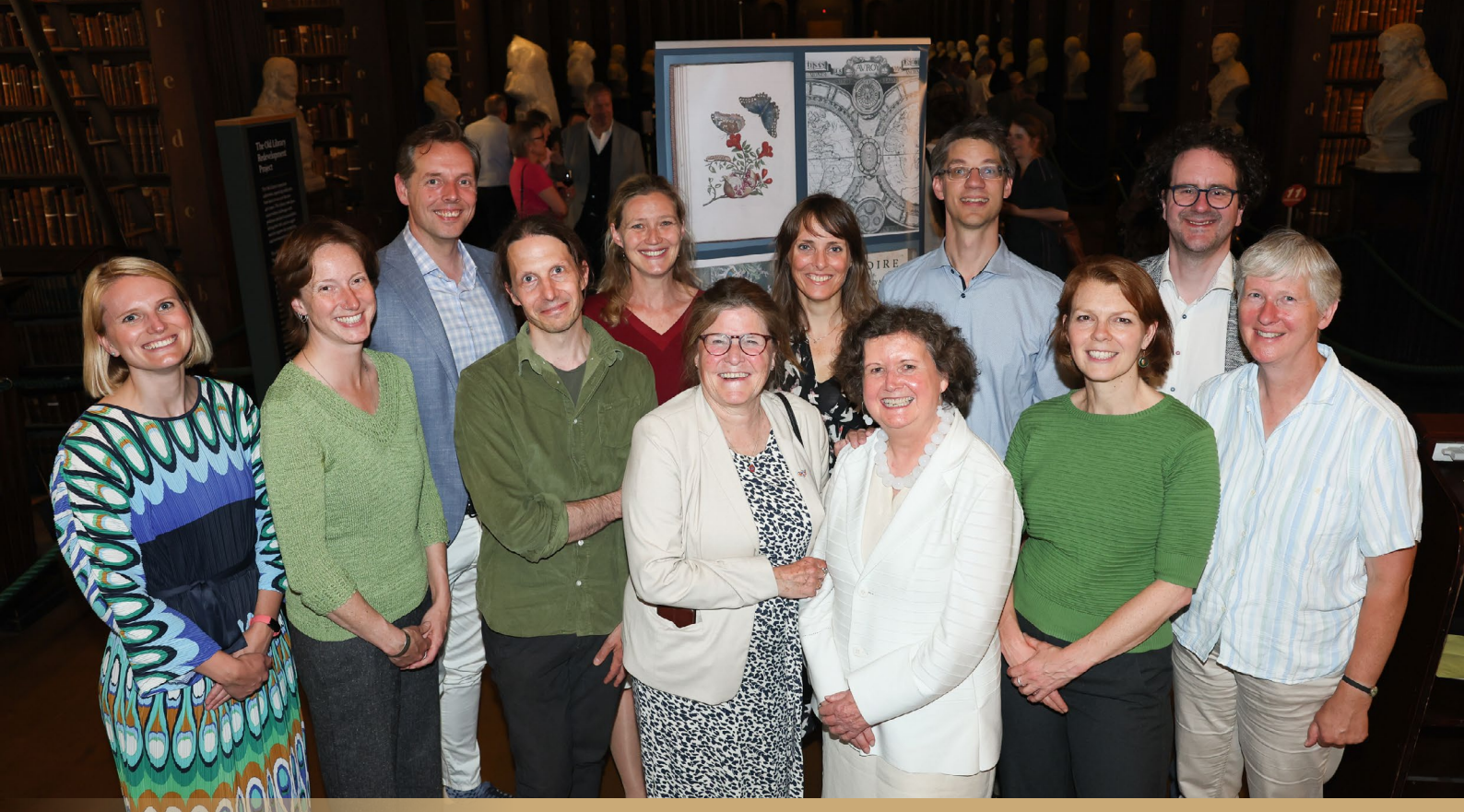
Members of the extended Fagel project team from the KB and TCD at the exhibition launch

Numerous presentations on the goals, progress and findings of the project were given. Talks were organised in Ireland and the Netherlands, for a broad range of audiences from general to specialised. As a project, Unlocking the Fagel Collection was represented at such events as the Embassy of the Netherlands in Ireland's online King's Day celebration in 2021, the Renaissance Society of America and International Federation of Library Associations congresses in 2022, and Ireland's Heritage Week 2023. In addition, project staff organised and hosted well-attended public events in The Hague and Dublin, at which the work of the project and related research was presented to interested audiences from the university and heritage sectors.