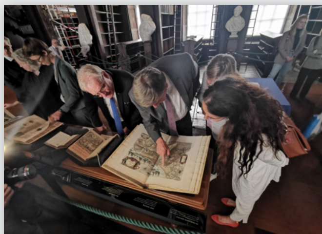
Minister-President Jan Jambon viewing books from the Fagel Collection during a State Visit to Ireland in 2022