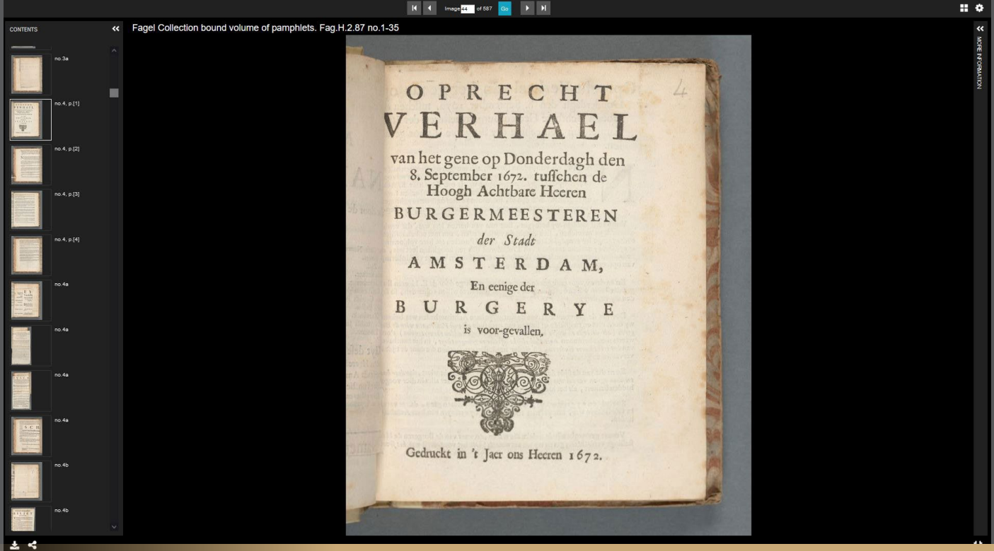
Online visualisation of a digitised volume of pamphlets