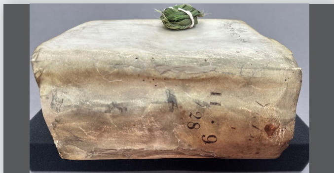
Fag.H.9.28 - Before and after conservation treatment