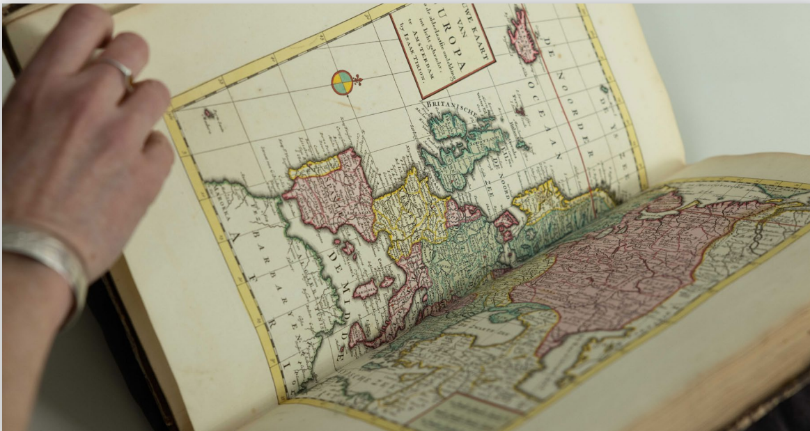
A reader consulting an atlas from the Fagel Collection