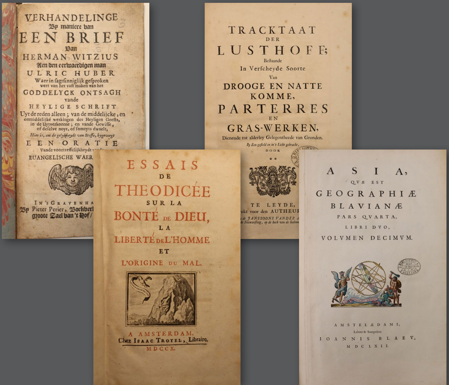
Title-pages of Fagel items recorded in the STCN for the first time