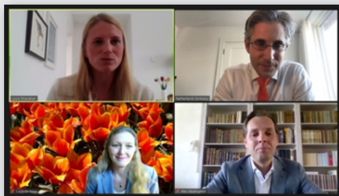
Screenshot of the online King's Day Fagel Event organised by the Embassy of the Netherlands in Ireland, 27 April 2021